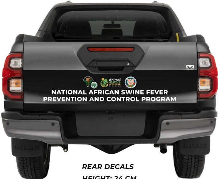
REAR DECALS HEIGHT: 24 CM WIDTH: 120 CM