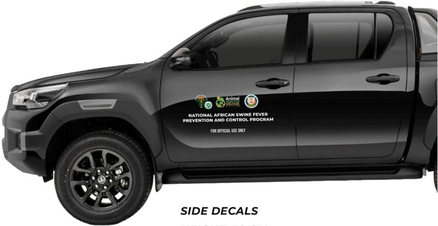
SIDE DECALS HEIGHT: 30 CM WIDTH: 65 CM