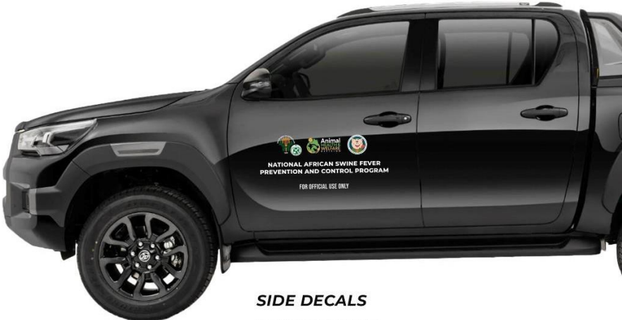
SIDE DECALS HEIGHT: 30 CM WIDTH: 65 CM