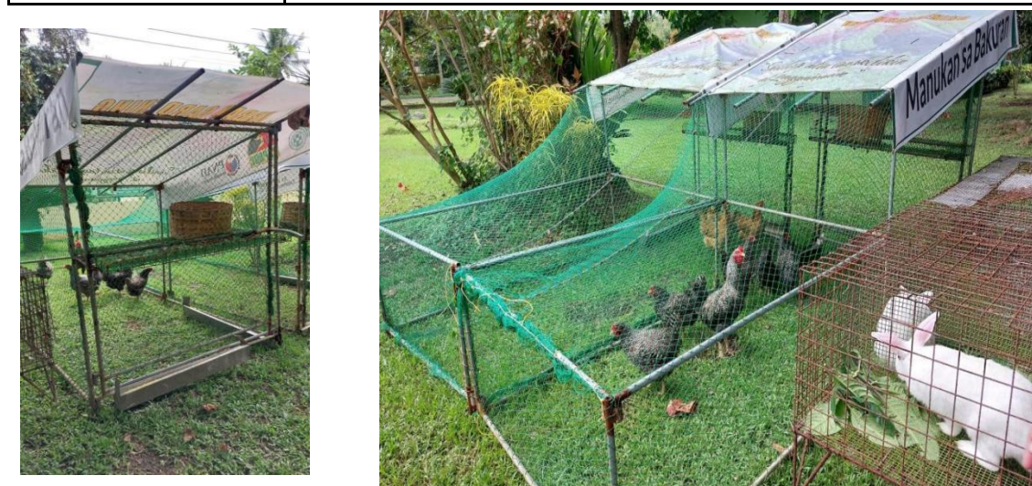
Figure 2. Specification of Chicken Coop