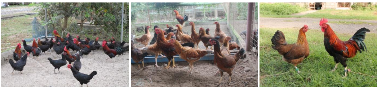
Figure 1. Specification of Chicken.