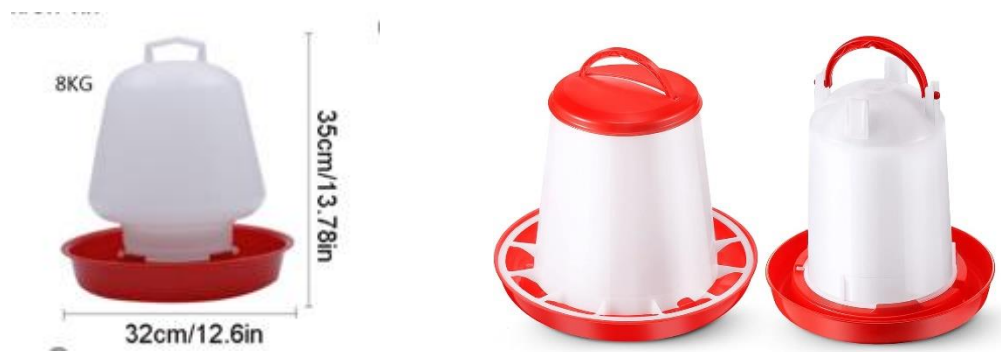
Figure 3. Specification of drinker and feeder