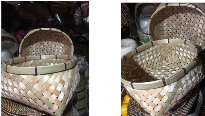
Figure 4. Specification of Egg Catcher